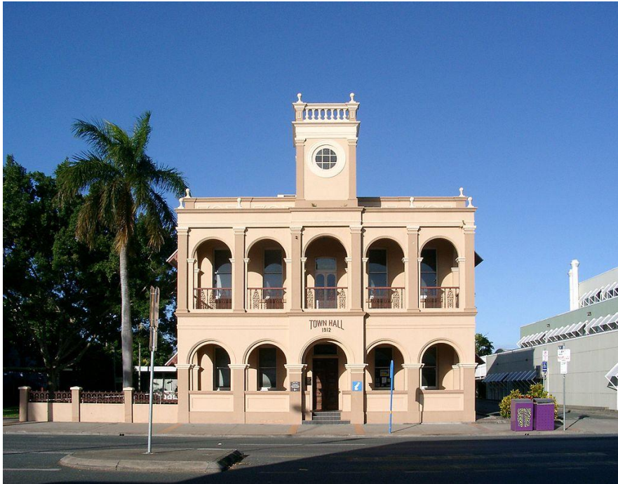
Old Mackay Town Hall